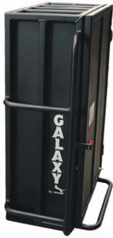
counterweight bucket for 45 weights